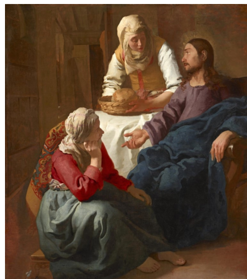
"Christ in the House of Martha and Mary"

He is the Lord of everyday, Not distant or apart, A King who dwells amongst us, His throne is in our hearts.