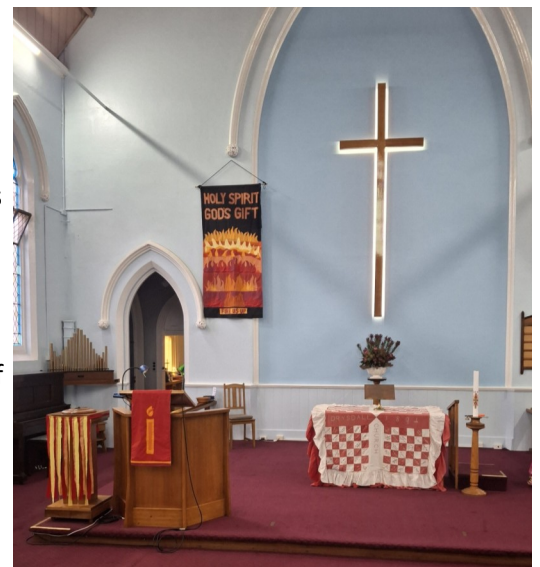
Our Pentecost display